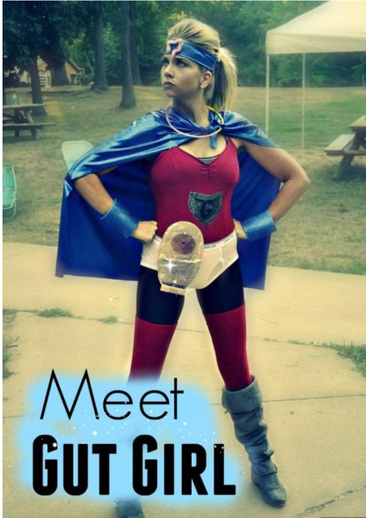
Figure 4. Gut Girl, the IBD superhero is pictured here displaying her superhero armor fully equipped with an ostomy pouch.

Taken together, these cases demonstrate certain intra-actions, particularly involving positive experiences with the ostomy, in which the ostomy and self become cyborg self.